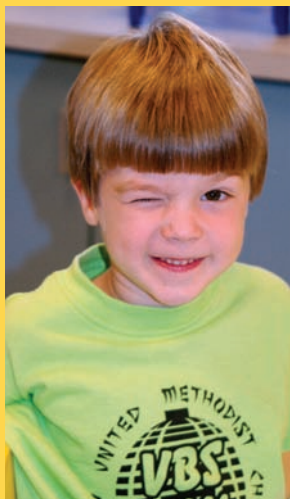
Pandamania at VBS!