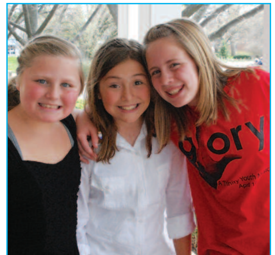
These girls were all smiles following the Youth Musical performance of Glory on April 10. More musical photos on page 3.