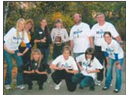
Syzran Youth are introduced to football

Please know that YOU, our Trinity family and friends, served with us. Through your generous support we were able to purchase MANY diapers and four double-strollers (their greatest need) for the House of Baby, as well as leave a very generous donation for Syzran UMC, which they will use to make some much needed repairs on the building, as well as support their ministry. Spasibo, thank you, for filling us with your love, surrounding us with your prayers, and supporting us with your generous gifts. Together, with Christ and in His name, we made a difference.