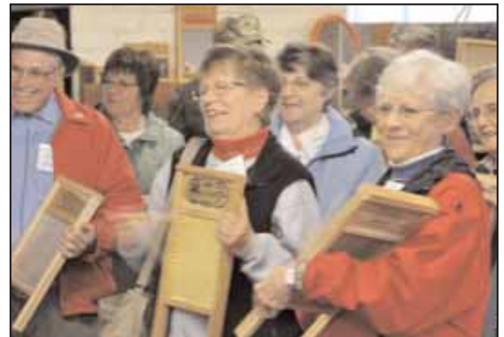
Playing the washboards at the Columbus Washboard Factory in Logan. The tour group donated a Washboard Troop Kit (washboard, washtub, clothesline, clothespins and soap) to a soldier overseas.