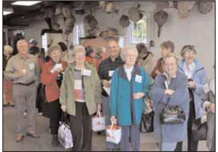
Apples and cider at the Laurelville Fruit Co.